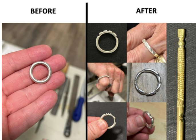
Carved rings, before and after.

Jessica provided many examples of finished metalwork and jewelry pieces that showcased the use of file carving on wire and sheet elements. After a quick demonstration on filing and carving contours into sheet metal, participants were given an 8-gauge round wire sterling silver ring to carve, along with heavy brass wire and copper sheet for practicing.