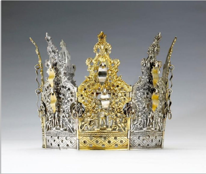
Norwegian Bridal Crown, from the Crowning the North exhibition.

Another distinguishing feature of the Norway of this period is the fact that it was ruled by an evolving cast of outsiders for centuries. While the city of Bergen was very wealthy, there was no domestic royal family or aristocracy to set the fashion or drive highly luxurious designs such as one might see in other European nations of this era. There was an underlying practicality in much of the work displayed, be it a guild cup, a communal tankard, or a wedding crown, itself often owned by a church and rented or lent to individual brides.