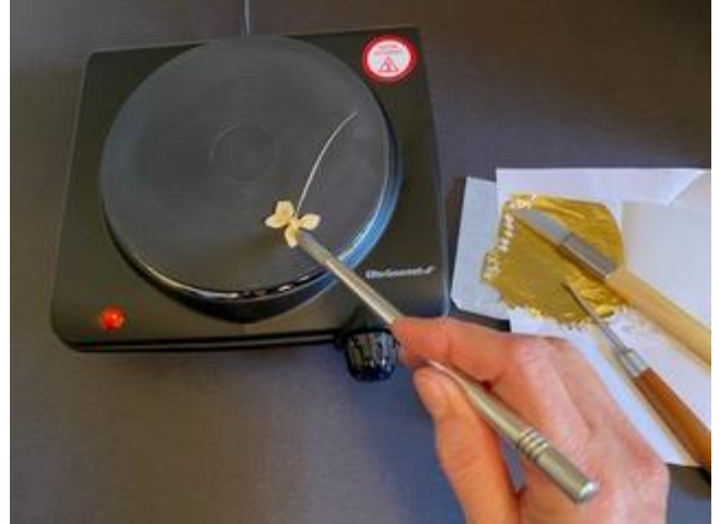
Keum-boo in action.