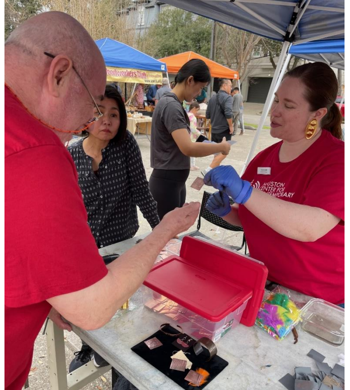
HMAG members sharing with the public at Craft Community Day.

On March 2, a group of HMAG volunteers joined other crafts artists and guilds at HCCC’s annual Craft Community Day. This day-long event lets the public learn about and try out various craft forms. At HMAG’s table, volunteers showed people how to texture copper metal blanks.