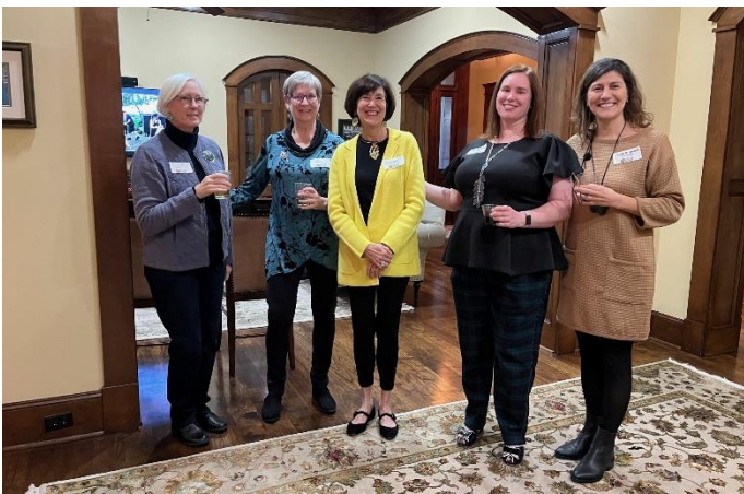
Members mingling at the party.