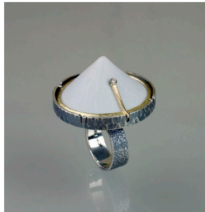
"Icecap Ring" Andy Cooperman

the principles of traditional stone setting to open possibilities that go way beyond the old standbys of prongs and bezels.