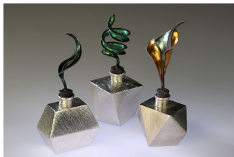
Terry Fromm, "Perfume Bottles," 2015