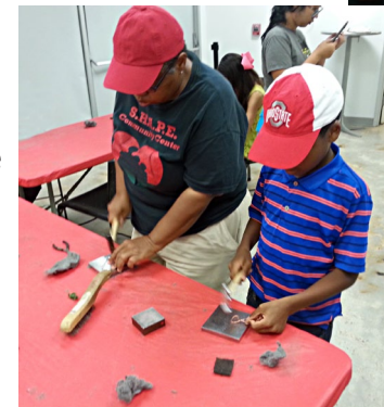
"Hands on Houston"